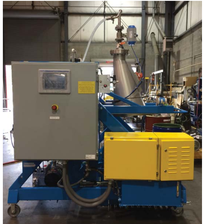
PLC control and hydraulic unit cabinets

The DDPS supplied P205 transfer system significantly improved containment of this hazardous material, and freed up operators to conduct other tasks while reactor charging is occurring. Process safety, product quality, housekeeping and maintenance all benefited from this system's installation.