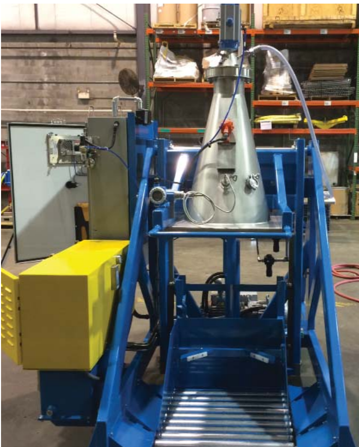
Drum loading carriage and transfer cone

Now, the operator only needs to wear a PPE respirator mask during those two brief times.